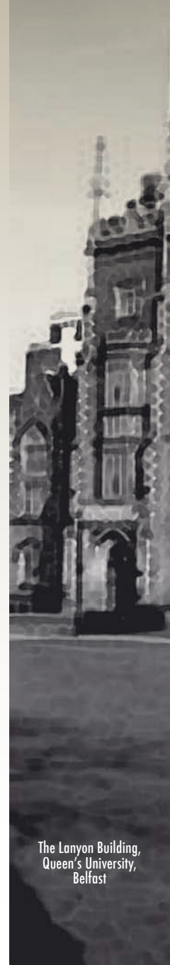
The Lanyon Building, Queen's University, Belfast

The optional tours are offered for spouses/companions with no particular interest in local & family history or for those delegates wishing to take a break from research.