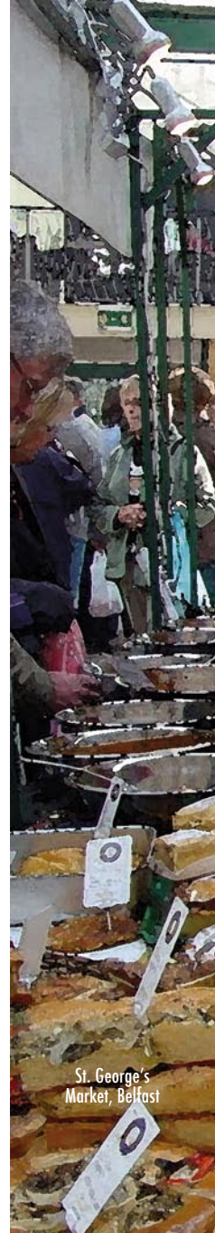
St. George's Market, Belfast